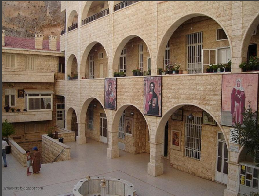
Inner court of the monastery during peaceful days