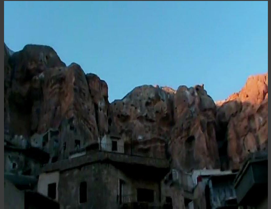
Sad and full of Al Nusra