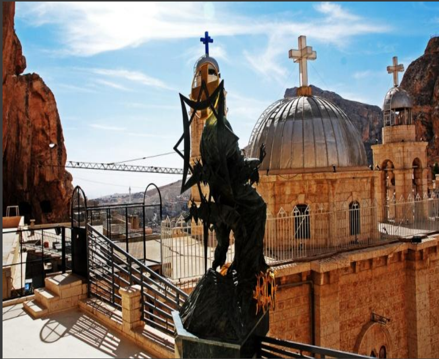
Before the Jihadists Assault