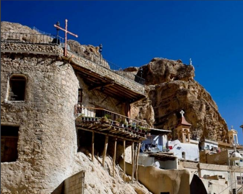
Vibrant and Full of life