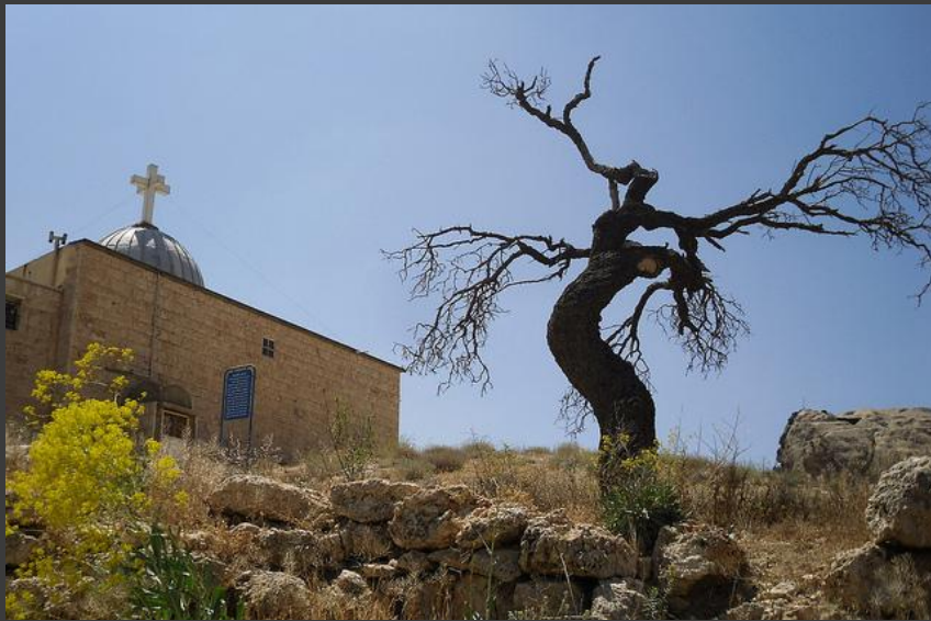
With the cross- 2010 - under Secular and Pagan regime