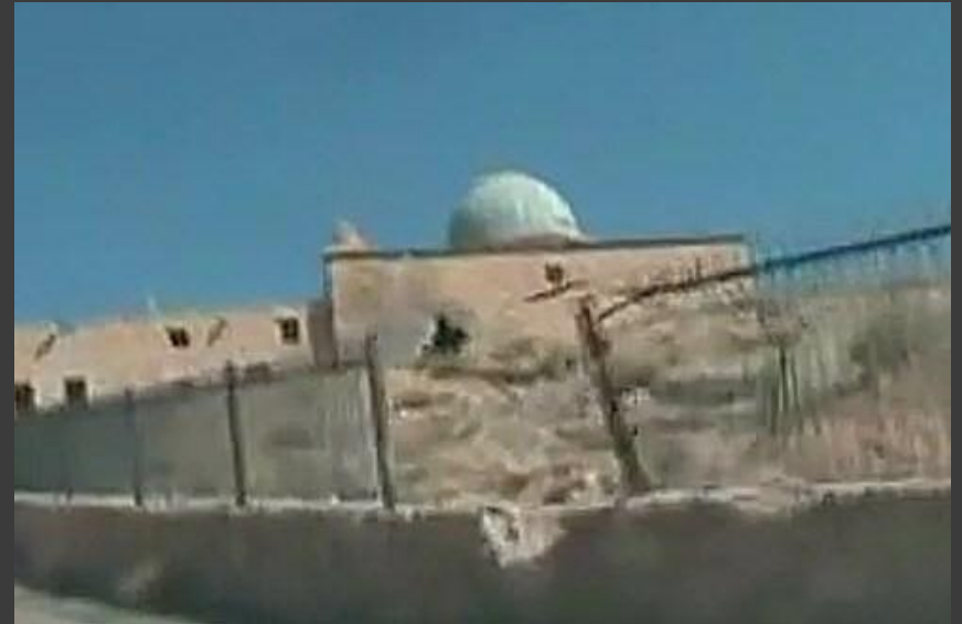
Without the Cross-2014 Under Islamic freedom