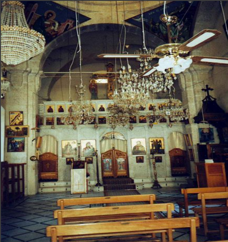
Place of peace and forgiveness