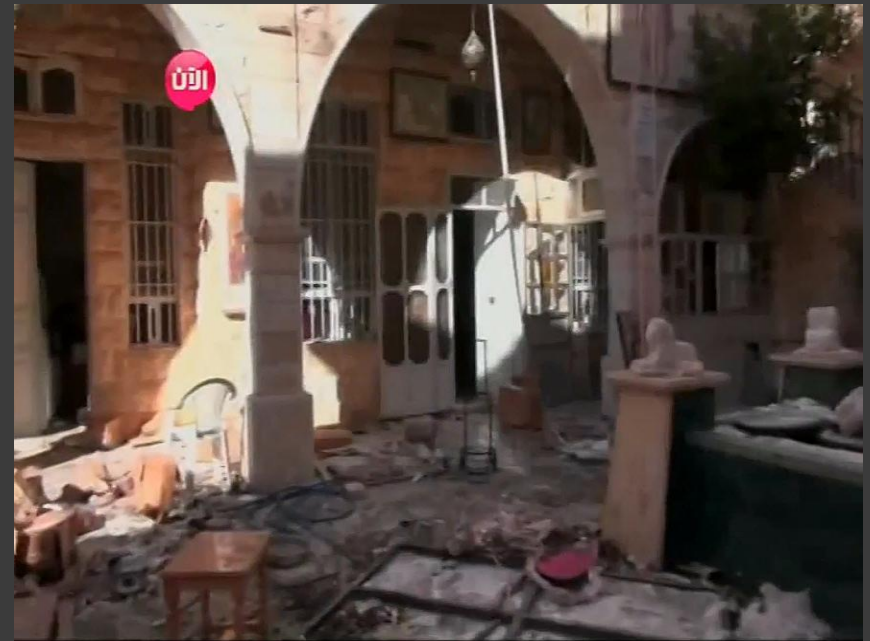
After Al Nusra took control