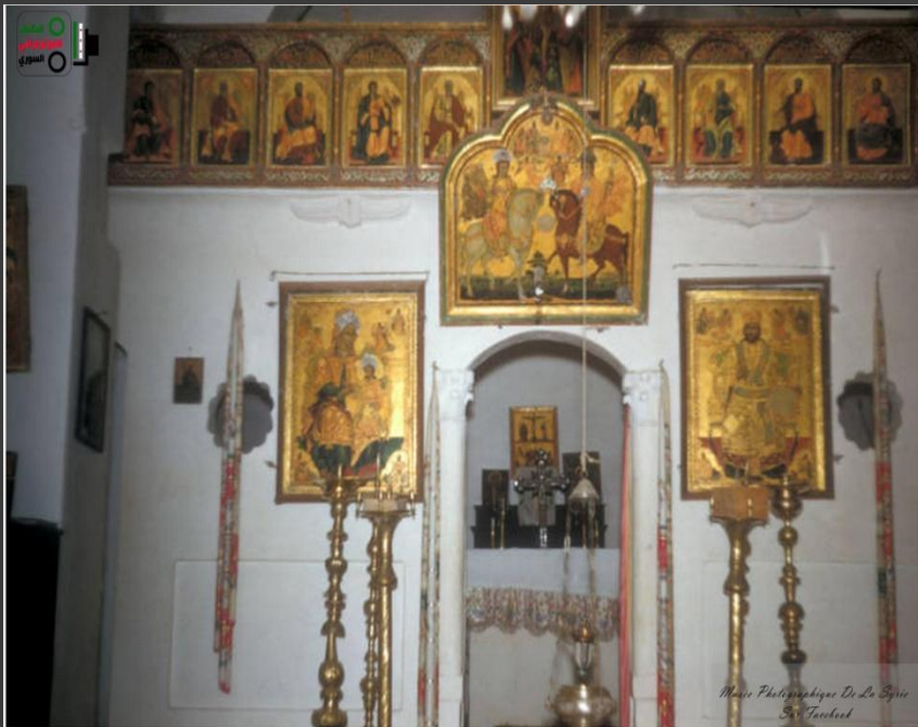
The Human Culture of Maaloula