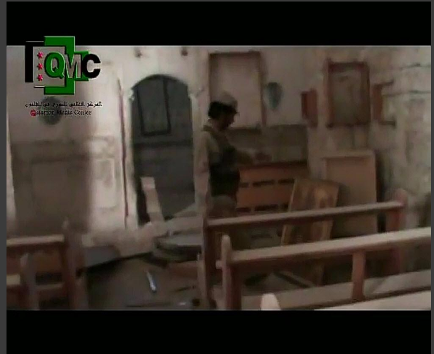
The cultural cleansing of Al Nusra