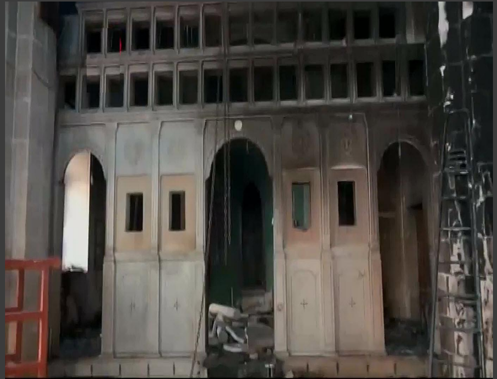
Witnesses to Al Nusra reforms